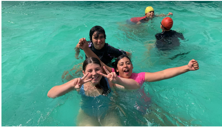
Cleasby students enjoying pool time