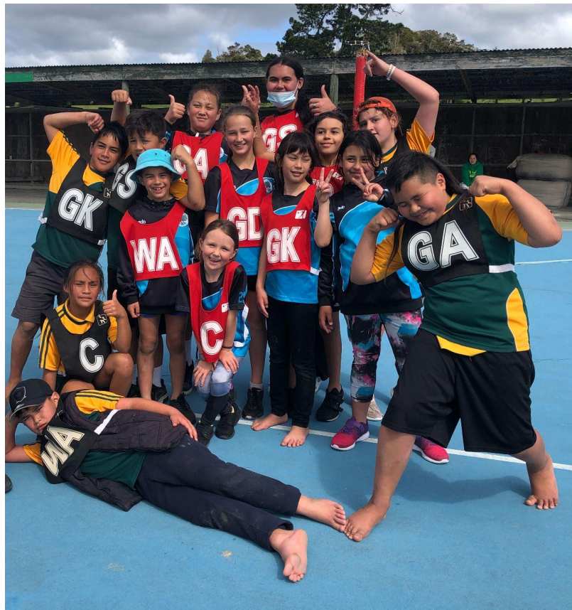
Our students and Te Kura Kaupapa Maori O Ngaringaomatariki