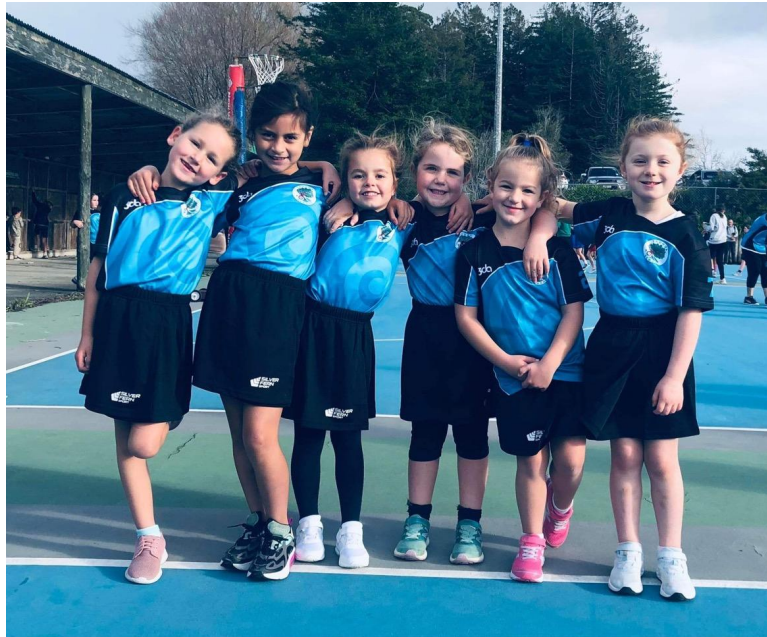
Year 1 and 2 team: Cute as!

Issue # 9 30th May 2022 Learning to Live, Living to Learn