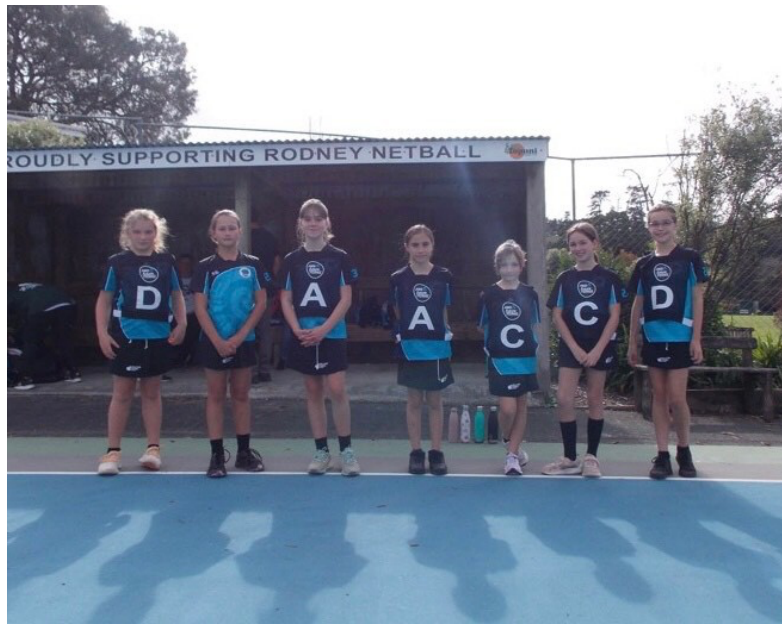
Tauhoa TauTaps: Our joint year five-six team

Issue # 7 May 2nd Learning to Live, Living to Learn